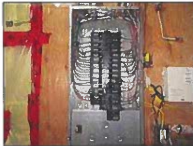
5.2 Picture 1

The main electrical panel was inspected and found to be installed properly and wired correctly. All of the proper sized breakers were present.