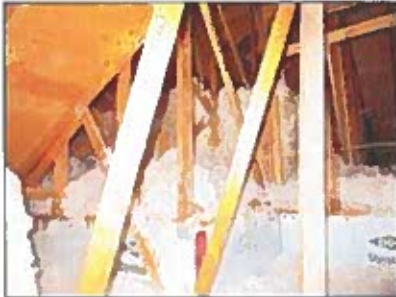
4.0 Picture 2