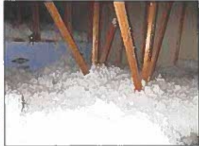
4.0 Picture 3