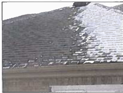
1.0 Picture 1

The entire roof surface is asphalt shingles. The shingles appear to be in good overall condition. They are installed well with all of the necessary caps and flashings.