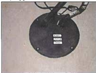
7.12 Picture 1

The sump pump should be tested on a regular basis to ensure its proper operation. The sump pump was unplugged at the time of the inspection. This should be left plugged in.