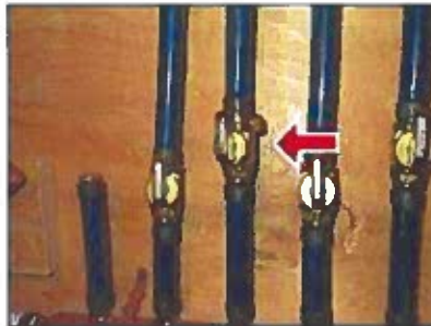
7.11 Picture 1

The outside taps should be shut off and drained before winter.