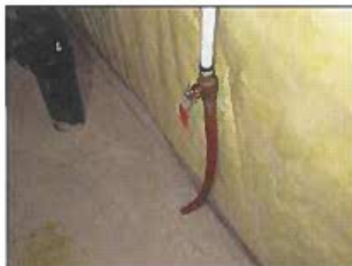
7.4 Picture 1