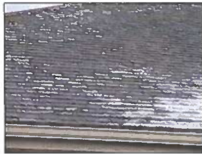
1.0 Picture 2