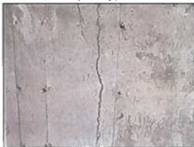
2.1 Picture 1

There is a slight crack in the garage foundation. This is quite typical and is not a structural concern.