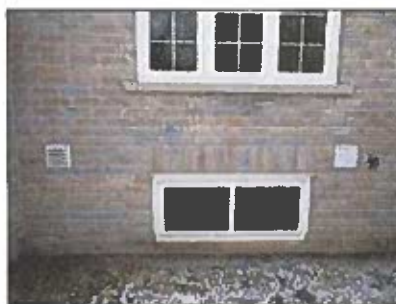
6.10 Picture 2

(2) The exterior vents for the heat recovery ventilator are installed improperly. One of these vents is supposed to exhaust stale air out and the other is supposed to bring fresh air in. The one to the right has flaps on it that open out when air exhausts out. However this vent is supposed to bring fresh air in. The two vents should be swapped with each other.