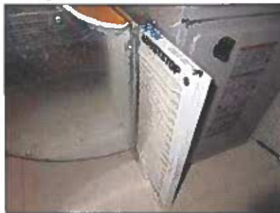
6.0 Picture 1