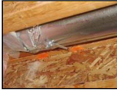
6.4 Picture 1