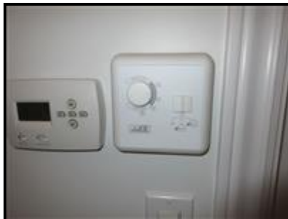
6.10 Picture 1

(1) The heat recovery ventilator located in the basement is a mechanical device that exchanges stale indoor air with fresh outdoor air. Heat is transferred from the outgoing air to incoming air by passing the two air streams through a heat exchange core. Stale air is removed from the bathrooms and then fresh air from outside is delivered to the cold air return which then circulates through the house. This device controls air quality and condensation levels in a well sealed house. This is controlled by a humidistat located beside the thermostat.