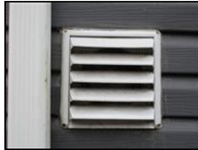
6.10 Picture 4

The heating and cooling system of this home was inspected and reported on with the above information. While the inspector makes every effort to find all areas of concern, some areas can go unnoticed. The inspection is not meant to be technically exhaustive. The inspection does not involve removal and inspection behind service door or dismantling that would otherwise reveal something only a licensed heat contractor would discover. Please be aware that the inspector has your best interest in mind. Any repair items mentioned in this report should be considered before purchase. It is recommended that qualified contractors be used in your further inspection or repair issues as it relates to the comments in this inspection report.