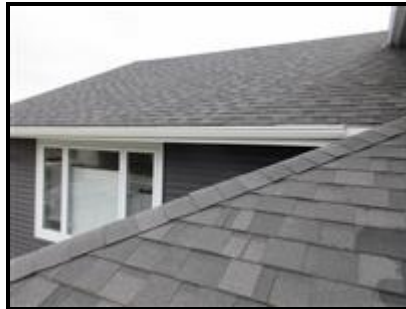
1.0 Picture 2