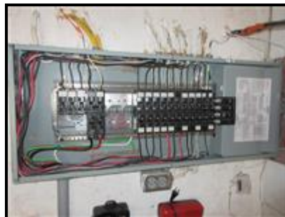
5.2 Picture 1

The main electrical panel was inspected and found to be installed properly and wired correctly. All of the proper sized breakers were present.