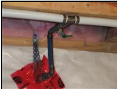
7.11 Picture 1

The outside tap should be shut off and drained before winter.