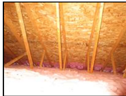
4.0 Picture 3