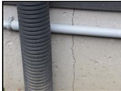
2.1 Picture 1

There are a couple minor exterior foundation cracks. These are quite typical and not a structural concern.