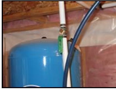
7.4 Picture 1