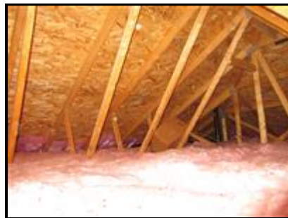
4.0 Picture 2