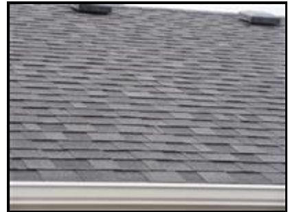
1.0 Picture 3