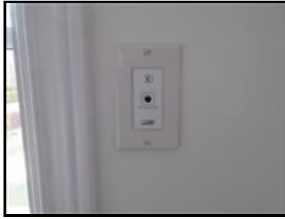
6.10 Picture 2

(3) The heat recovery ventilator filters including the outside fresh air intake screen will require cleaning on a regular basis (see manufacturers recommendations).