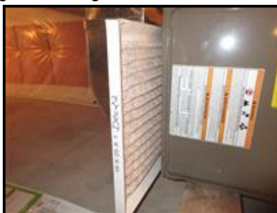
6.0 Picture 1