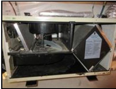
6.10 Picture 3

(3) The heat recovery ventilator filters including the outside fresh air intake screen will require cleaning on a regular basis (see manufacturers recommendations).