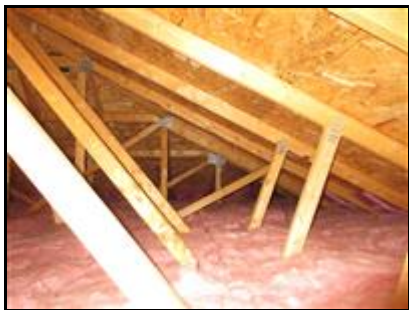
4.0 Picture 1

The attic contains fiberglass batt insulation. This insulation appears to be well placed and installed in more than adequate amounts.