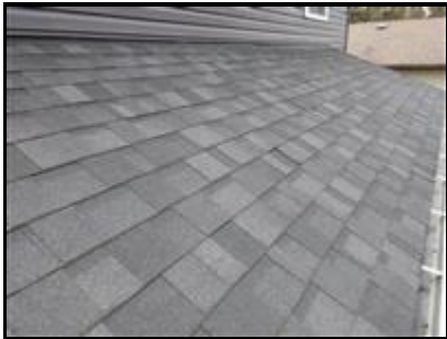
1.0 Picture 1

The entire roof surface is asphalt shingles. The shingles appear to be in very good overall condition. They are installed well with all of the necessary caps and flashings.